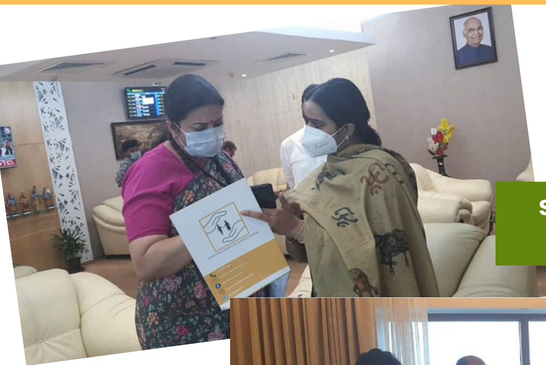
Smt Smriti Iraniji Union Minister