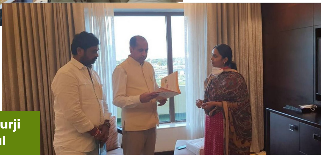
Shri Jayram Takhurji CM of Himachal Pradesh