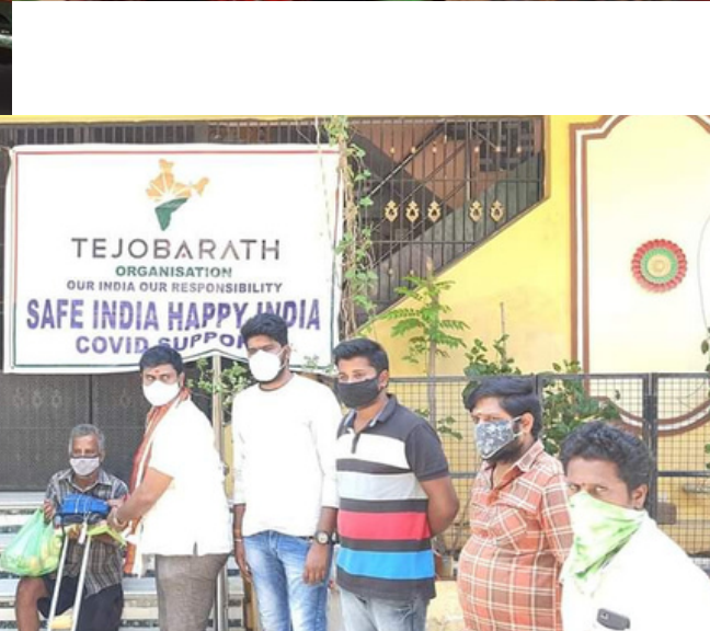
Distribution of sustenance