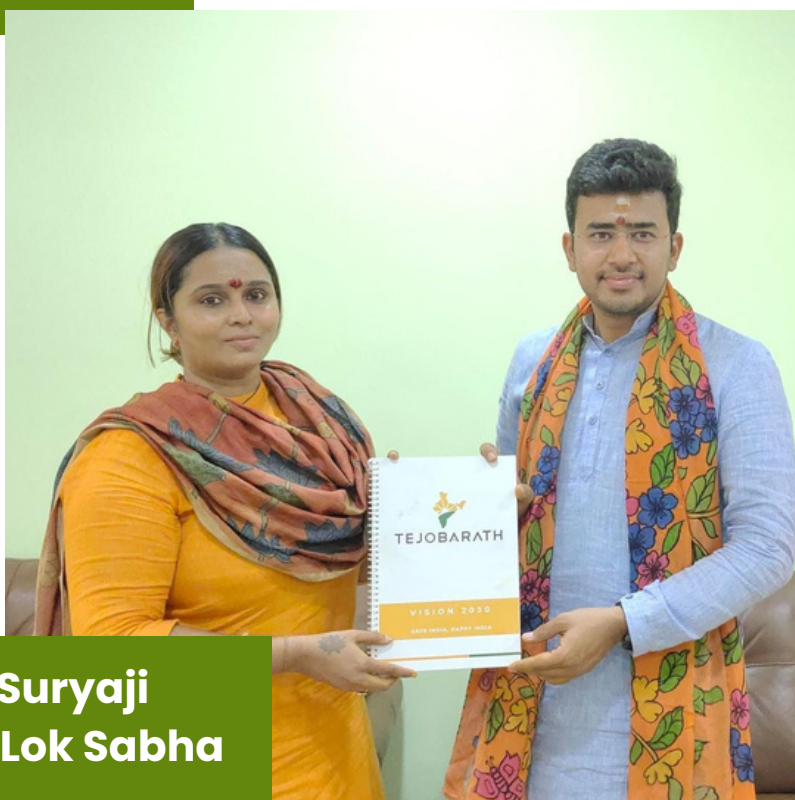
Tejasvi Suryaji Member of Lok Sabha