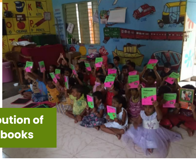
Distribution of notebooks