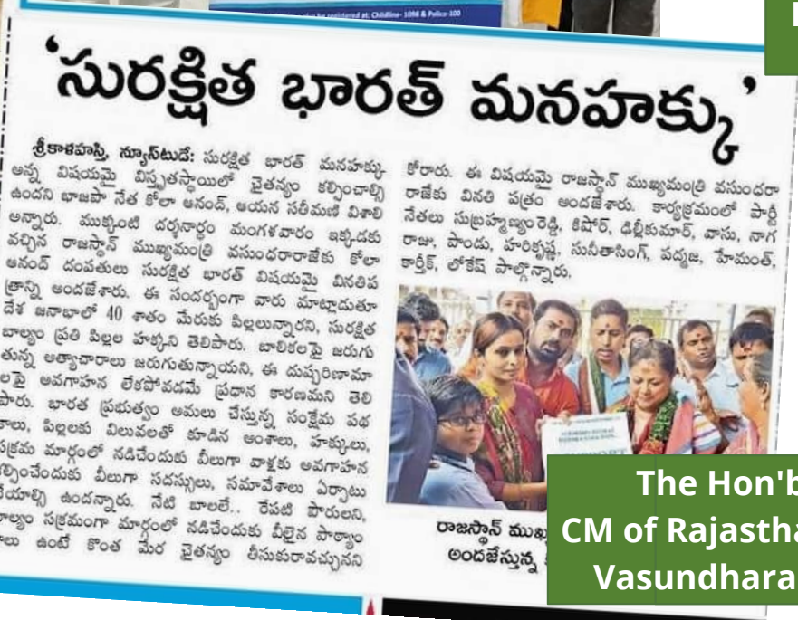
The Hon'ble CM of Rajasthan Smt. Vasundhara Raje