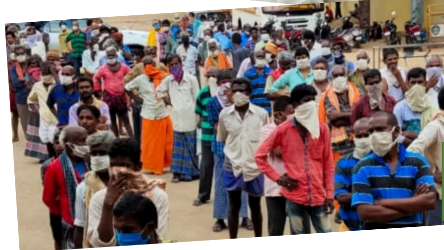
Distribution of essentials during COVID-19