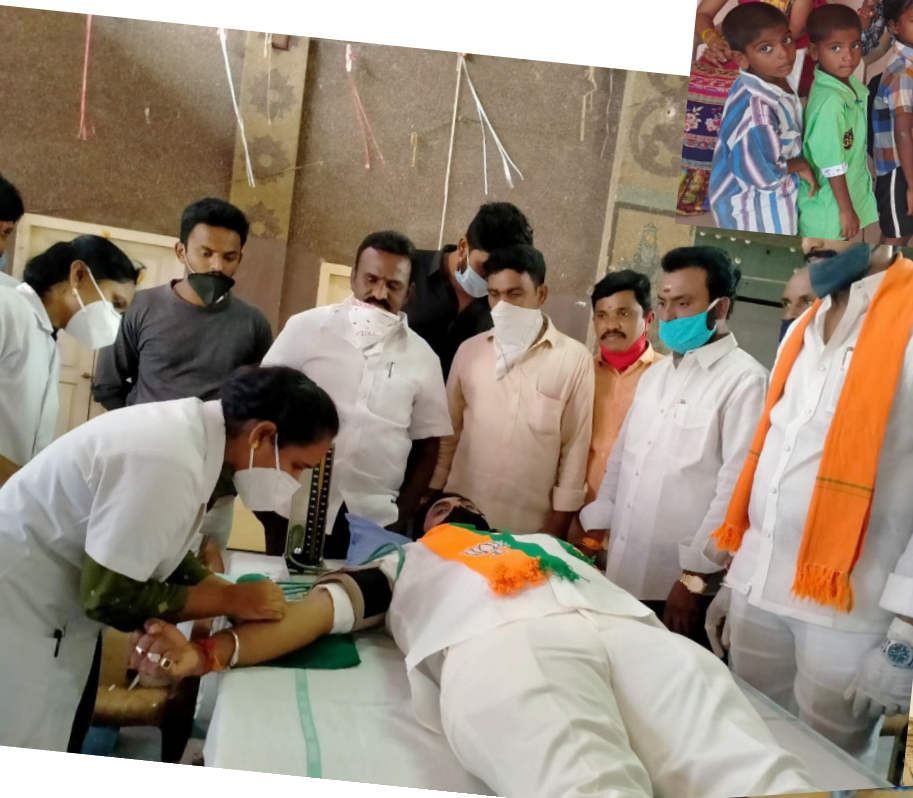
Blood donation camp