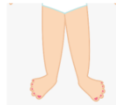
Between your legs