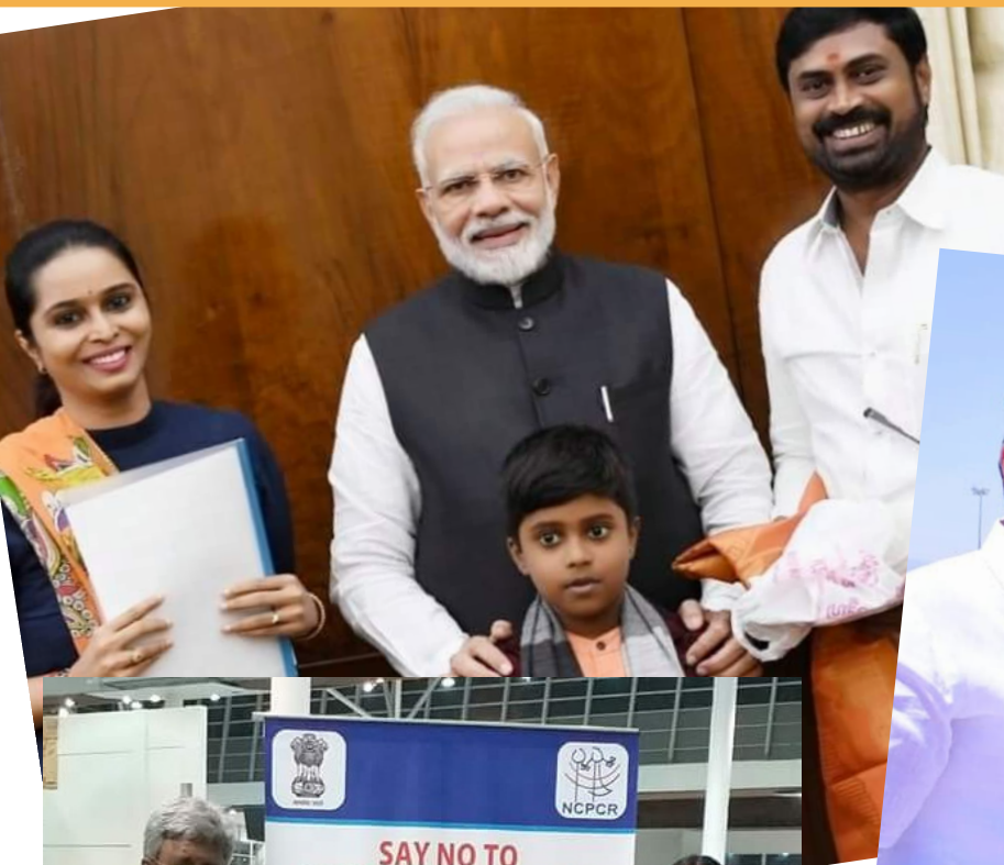
The Hon'ble Prime Minister Shri Narendra Modi