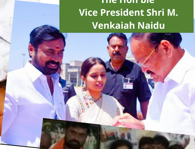
The Hon'ble Vice President Shri M. Venkaiah Naidu