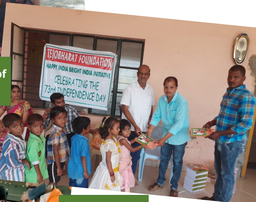
Distribution of stationary