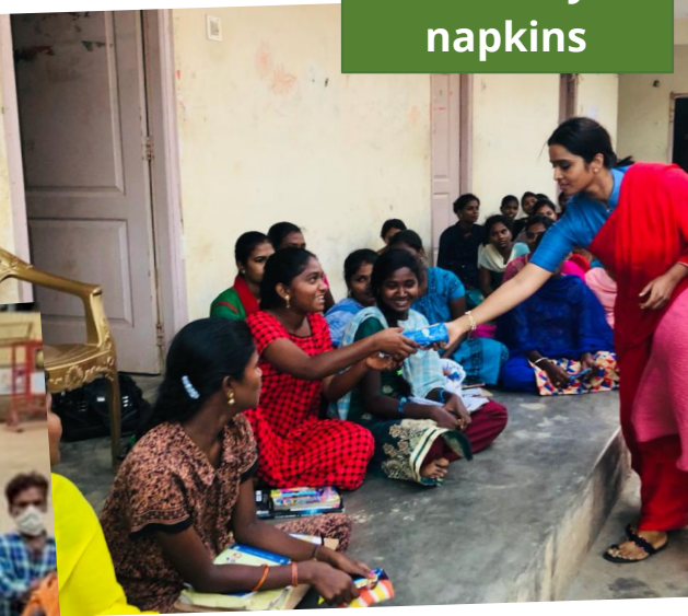
Distribution of sanitary napkins