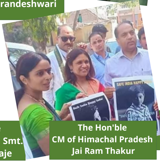
The Hon'ble CM of Himachal Pradesh Jai Ram Thakur