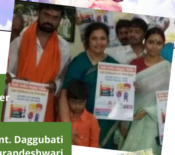
Smt. Daggubati Purandeshwari